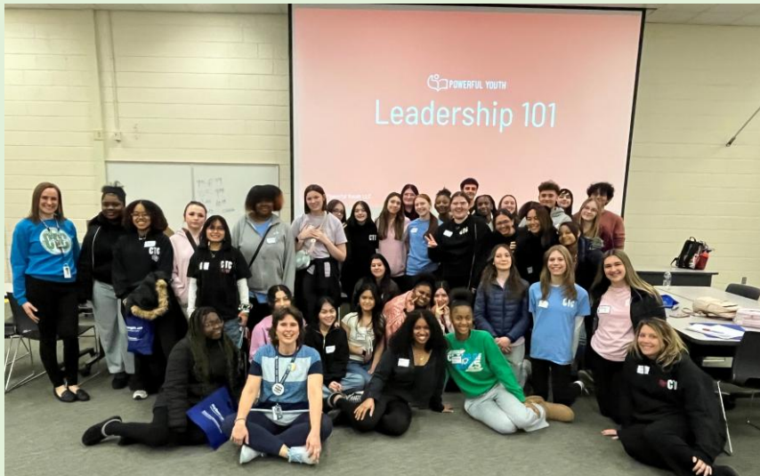
Leadership Training with CVHS CTC