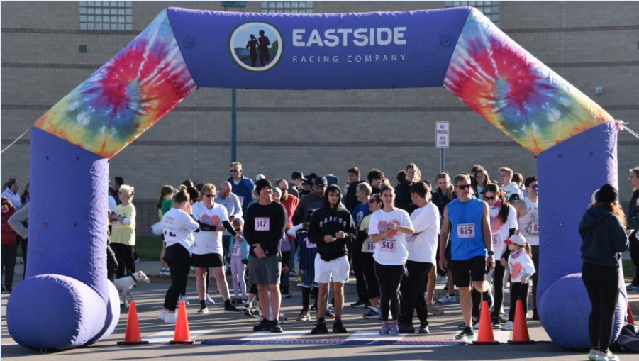
Be Aware 5k