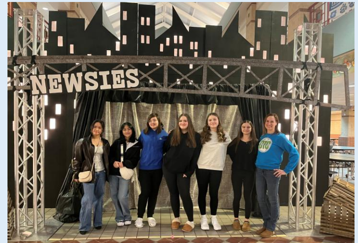
School Musical Outing