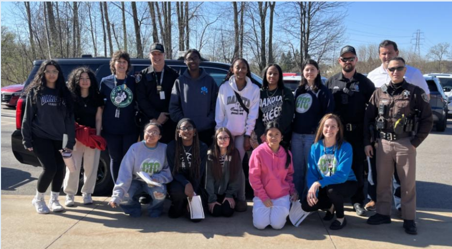
Alcohol & Tobacco Retailer Project