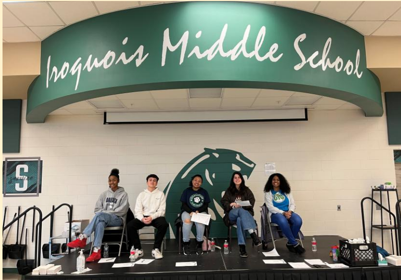
Middle School Panels